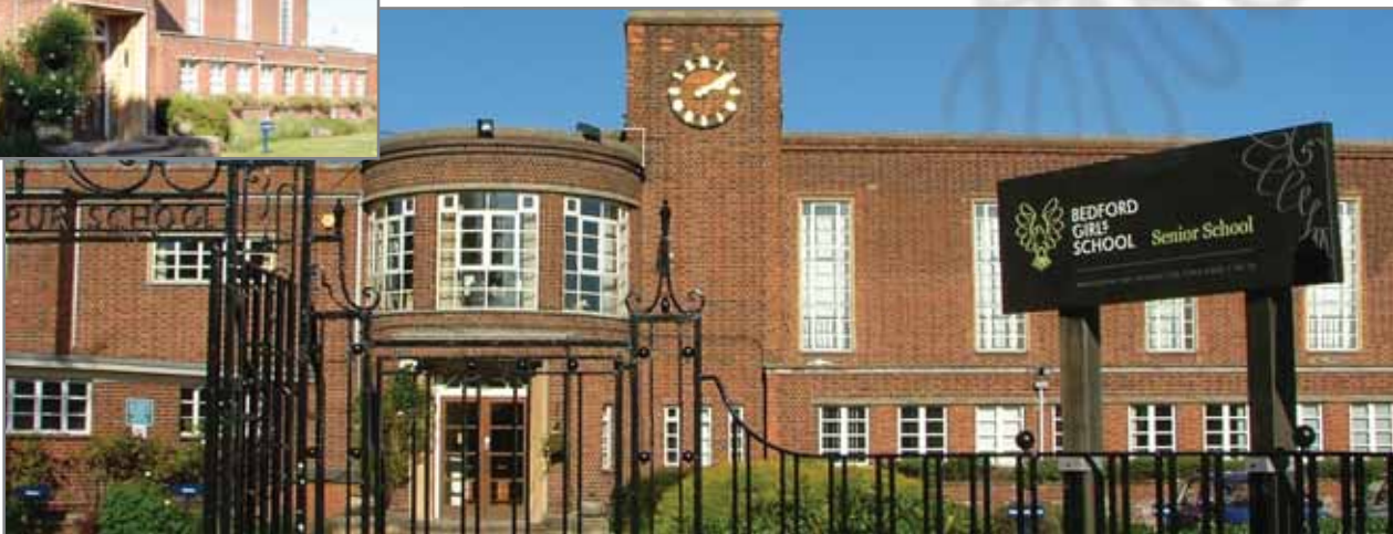
Front of Senior School

The Senior School is due to be completed in September 2011 with the exception of Years 11 and 12 who will remain at the current Bedford High School for Girls' site on Bromham Road until July 2012. This is in order to minimise disruption to their students' studies in these important academic years.